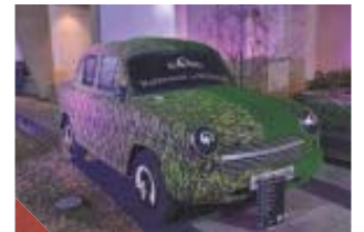
▶ Hetal Shukla's Paradox of Paradise plays with green color of nature and green color of military. It asks us to ponder to be a nationalist or a naturalist.