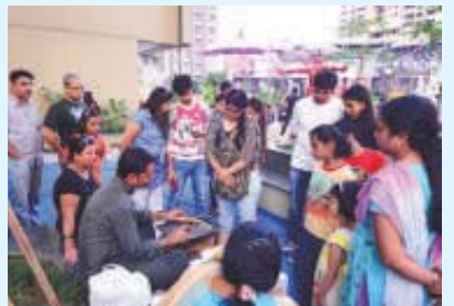
▶ Bangle making workshop in progress enchanting girls and ladies.

The acts by these artists weren't the only highlights of the HTKGAF Reloaded at Runwal Elegante there were a series of workshops like pottery, calligraphy, origami, mural paintings, bangle making, tattoo making and caricatures to name a few.