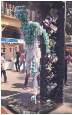
▶ A breakthrough of a Thescape Spirit by Sunny Mistry depicts a co-existence between bodily shape and the natural spirit of nature and urges to capture it before it disappears.