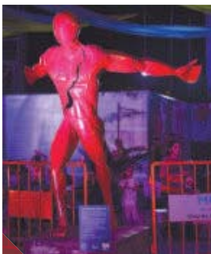
▶ The Adventure Called Youth by Swapnil Ghodse is a quasi-realistic representation of the endurance and perseverance exuberated by an individual, either it may be a physical or mental task. The quality, as well as quantity of work, marks the adventure of youth.