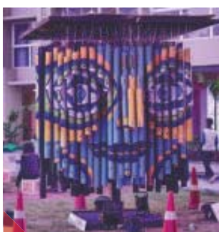
▶ Face of Nature by Alumni of MIT Institute of Design depicts the duality of nature using contrasting facial expressions. One face depicting Raudra, the destructive side of nature and Saumya the other face, the caring side of nature.