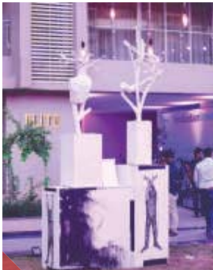
▶ Displaced by Ritu Dhillon shows the mass displacement, migration and war. The trees sprouting out of a male torso depicts the crazy world we live in. Where things don't make sense.