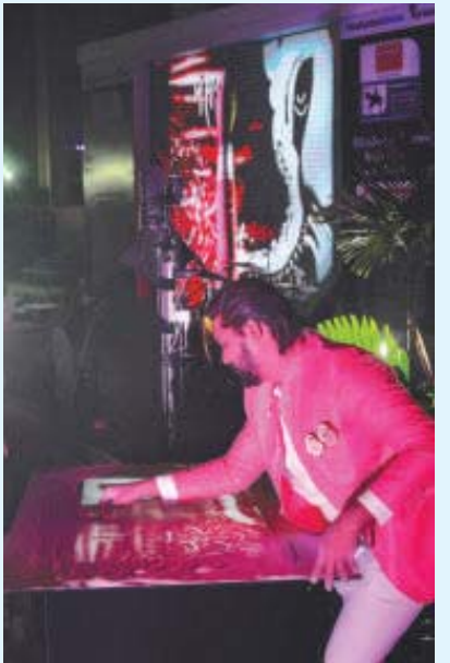
▶ Shri Nitish Bharti one the finalist of India's Got Talent showing various regions of India.

HTKGAF Reloaded at Runwal Elegante is scheduled to end on 25 February 2018 and the activity line up is even more eventful over the last few days of the one of its kind art festival in the western suburbs.