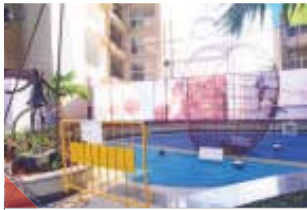
▶ The Apple structure built through the mesh-like appearance is a way attempted by the artist Swapnil Godase to portray the transparency and immediate effects a fruit brings upon a human body.