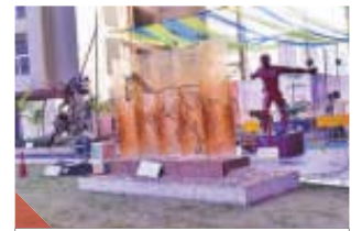
▶ Ka-la Ghoda by Indrajit Prasad captures the spirit of living in a city like Mumbai in terms of language, geography, and natural environment. The concept of the work is to engage in the festive mood of the city.